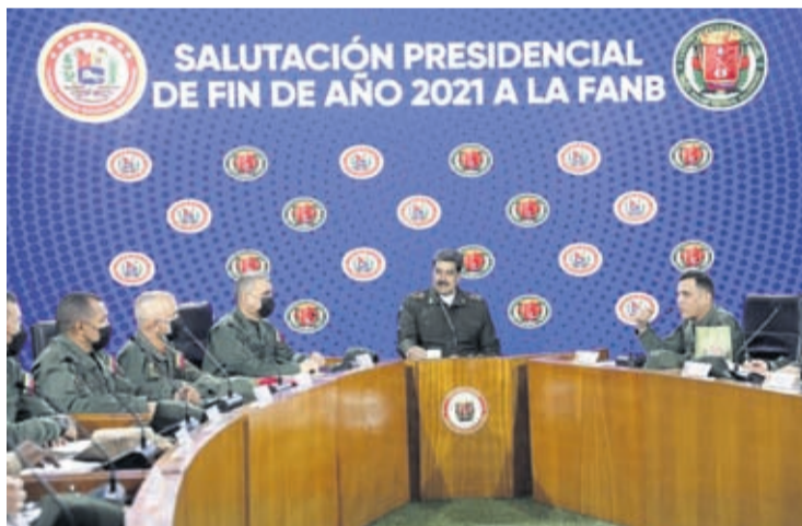
(ElNacional) – Presidente Nicolas Maduro a pidi e Fuerza Armada Nacional Bolivariana (FANB)

pa adapta y perfecciona e capacidad di reaccion den tempo real pa cualkier menasa of agresion interno of externo contra e pais Caribense.